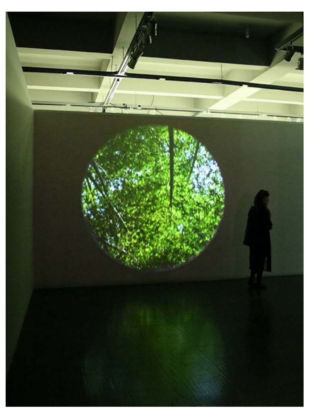
Right: *Descriptions True & Perfect* at the Main Gallery, Jilin University of Arts, Changchun, China, 2016.