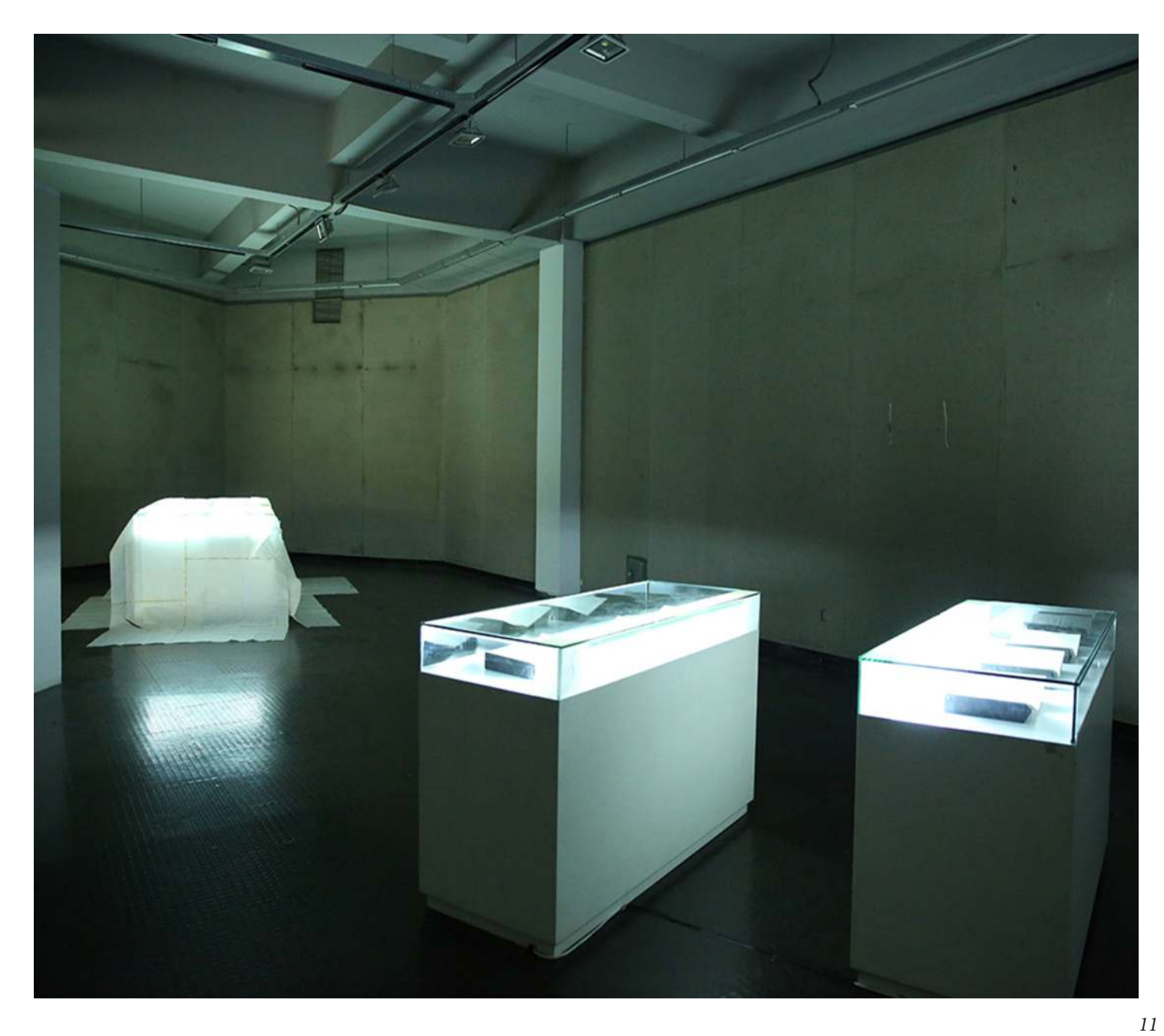
Right: Descriptions True & Perfect at the Main Gallery, Jilin University of Arts, Changchun, China, 2016.