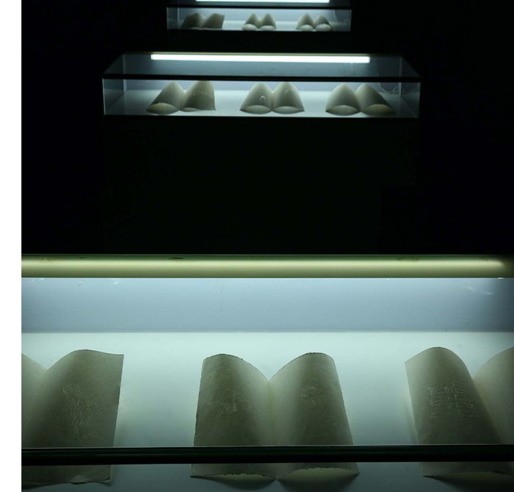
Right: Descriptions True & Perfect at the Main Gallery, Jilin University of Arts, Changchun, China, 2016.