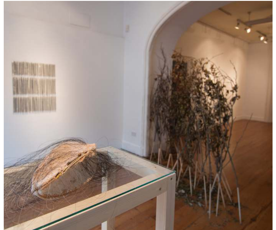
Right: Fair to Good Provenance , installation shots.