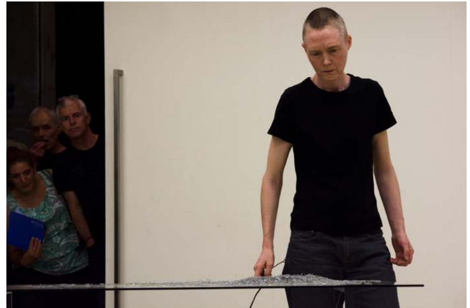
Above: Contingent , solo performance, SASA Gallery, Adelaide, Australia.