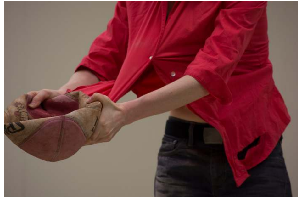
Right: Contingent , solo performance, SASA Gallery, Adelaide, Australia.