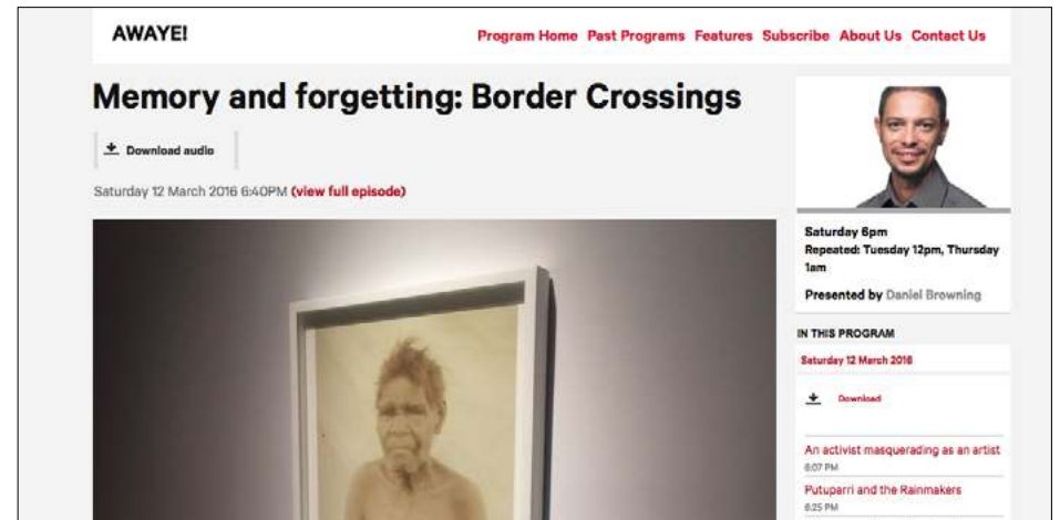
Above: Awaye (screenshot)