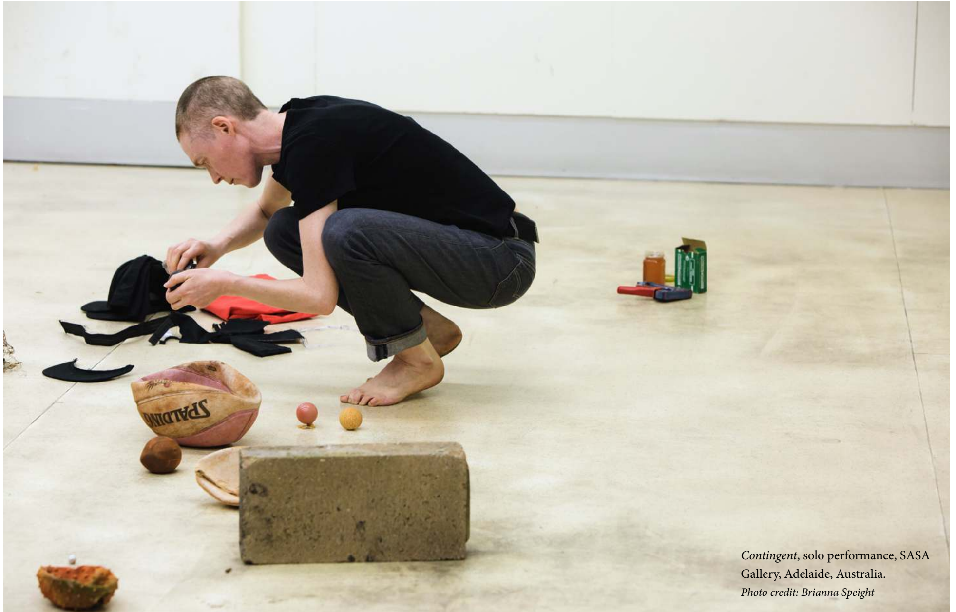
Contingent , solo performance, SASA Gallery, Adelaide, Australia.