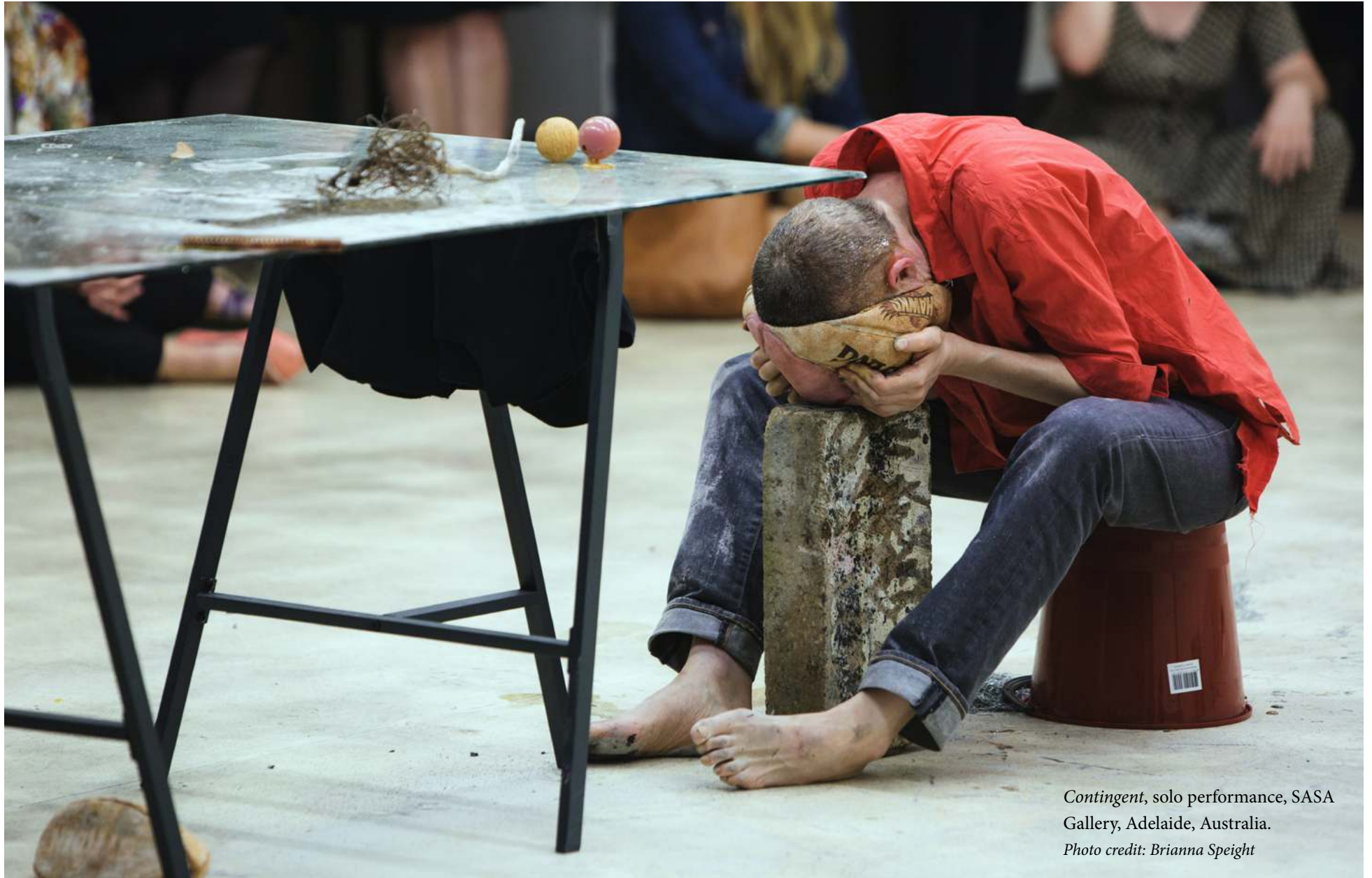
Contingent , solo performance, SASA Gallery, Adelaide, Australia.