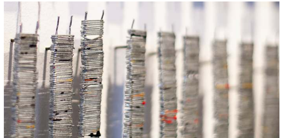
Right: Fair to Good Provenance , (staples detail) installation shot