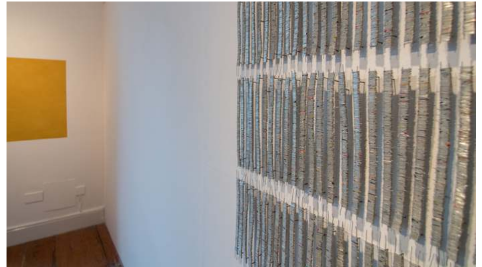
Above right: Fair to Good Provenance , installation shots.

The two SASA performances worked with the symbols of fire and honey bee, especially significant to the Walpiri community, whereas the Galway collaborative performance explored ideas about the invasive colonial impact of Irish settlers on the nomadic cultures that were systematically oppressed. The residency also provided raw materials derived from daily desert walks for sculptures exhibited in Galway (one created from thousands of bent, paint covered staples removed from the backs of Aboriginal artist's paintings during the cataloguing process). The sculptures became the installation, Fair to Good Provenance , where elements such as ochre, which has spiritual connotations for indigenous artists, was hand blown onto the gallery wall signalling its qualities as both specific symbolic colour and animate matter.